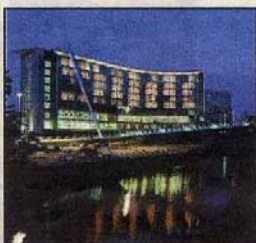
STYLISH: The luxurious Lowry Hotel

Despite spending more than 35 years living and working in the UK, I don't really know my own country very well. I would happily travel overseas to the furthest regions of the planet and spend my annual holiday in search of foreign adventure, but it never really crossed my mind to stay in England and explore. Now living in Dubai for a number of years, the thought of returning to my homeland as a weekend tourist was a strange concept. Why would I now travel 5,600km miles to explore a city I once lived two hours from on the