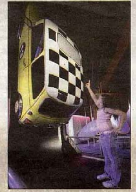
INTERACTIVE: Museums for all ages

Ethihad also offers two night packages with breakfast at the five star Lowry Hotel in Manchester starting from dhs5,060 per person including a match-day ticket for Manchester City, return economy flights from Abu Dhabi, and all applicable taxes and surcharges